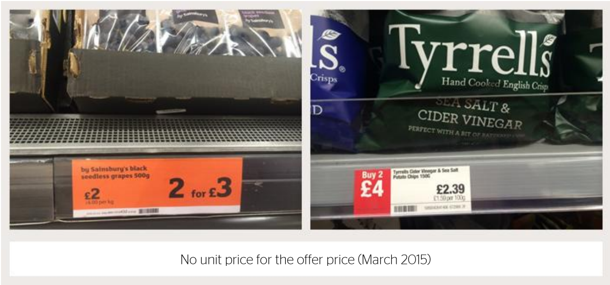
No unit price for the offer price (March 2015)

The third issue with current unit pricing practice is that some supermarkets do not always provide unit pricing information for products when they are part of a special offer. This is an issue because it makes it more difficult for consumers to compare the price of the product included in the offer with similar products that are not on offer. It could be the case that these other products are still better value and consumers would make a different choice if the unit price was provided on the offer.