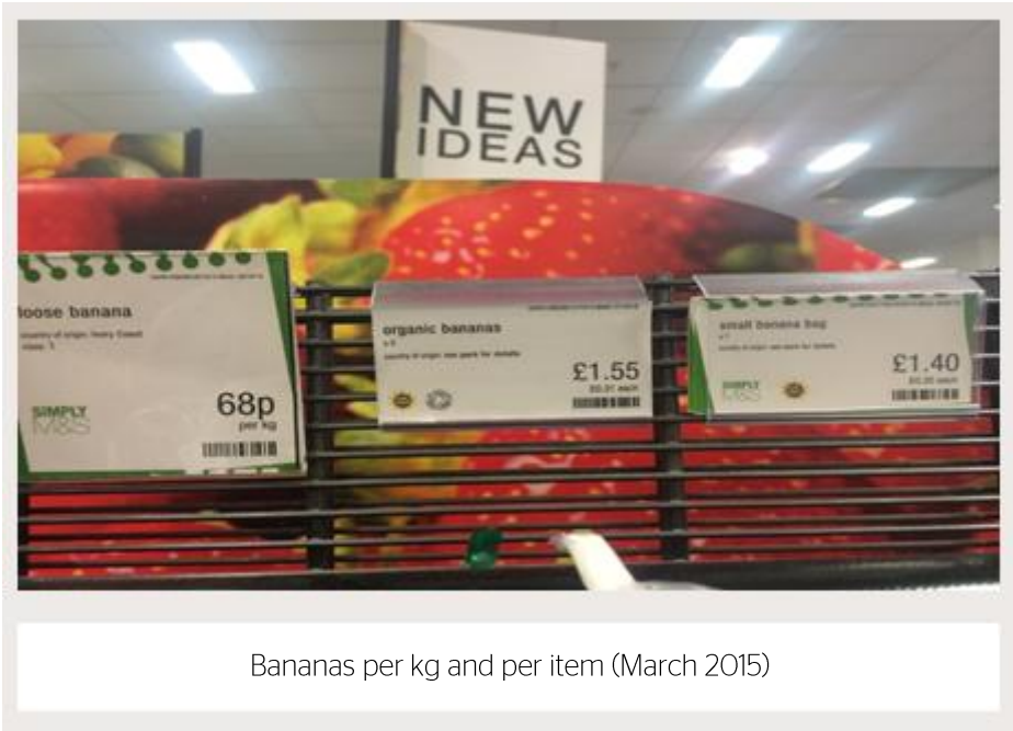
Bananas per kg and per item (March 2015)

Fruit and vegetables are particularly problematic. This is also because there is the option of providing the unit price by kg and by per item, where there are provisions for countable produce to be packed per item under relevant Weights and Measures legislation. 28 We have found numerous examples of where it is very difficult for consumers to work out which product is best value without using scales.