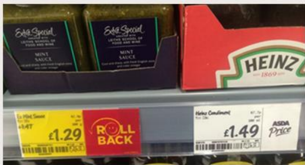
Sauces per 100ml and per 100g (March2015)

Our research has indicated that the complexity of this schedule means that it can be difficult for supermarkets to work out which applies, particularly where there is ambiguity over what is cooked or not, for example. The many categories mean that mistakes can be made in ensuring that correct shelf edge labels are used in-store given the large number of price changes. The categories used, which were developed when the order was adopted in 2004, do not necessarily reflect the way that people shop and compare products now. Under the schedule, for example, raw prawns are required to be sold per kg; cooked prawns per 100g, whereas consumers may base their purchase on which one of these is cheaper.