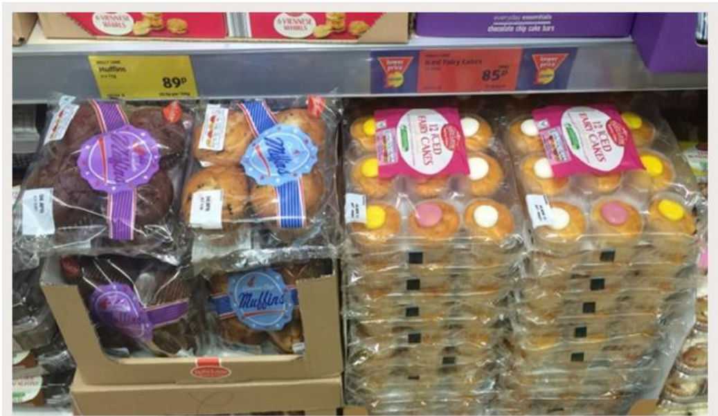
Cakes per 100g and per item (March 2015)

Some specific problems have also arisen in relation to certain categories, such as how to price semi-solid products such as mayonnaise or ice cream, which can sometimes be sold by weight and sometimes by volume. Inconsistent approaches have been used by different manufacturers. The same applies to where products can be priced by weight or by 'per item'. Examples of this include snack bars and biscuits.