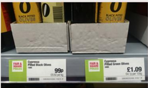
Olives per kg and per 100g (March2015)

Some specific problems have also arisen in relation to certain categories, such as how to price semi-solid products such as mayonnaise or ice cream, which can sometimes be sold by weight and sometimes by volume. Inconsistent approaches have been used by different manufacturers. The same applies to where products can be priced by weight or by 'per item'. Examples of this include snack bars and biscuits.